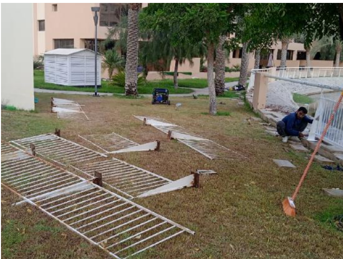
Partial replacement of the fencing along the main JI lake