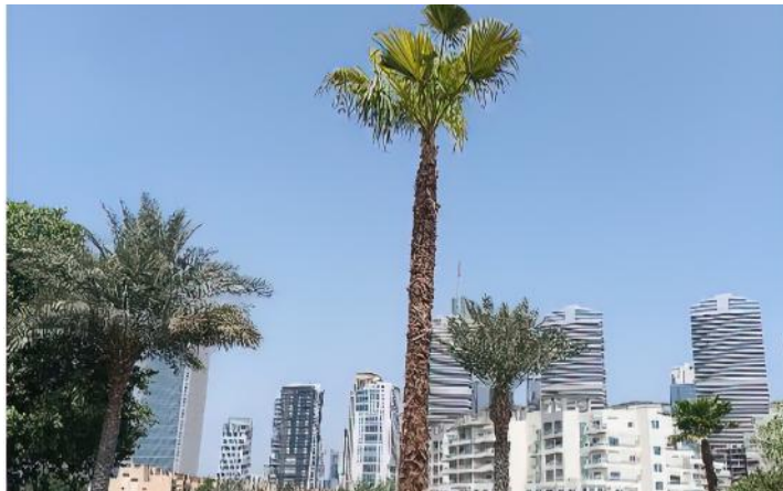
Phase 1 of Landscaping Enhancements was completed and Phase 2 has commenced, focusing on the centre median and right-of-way landscaping