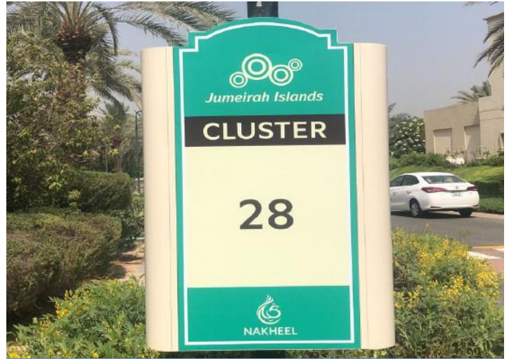
Signage cladding and posts painting, and installation of new signage is in progress