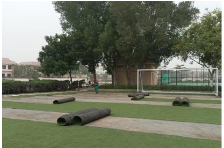
Removal of existing Astroturf & ground compaction completed; installation of new Astroturf by 29.08.2022