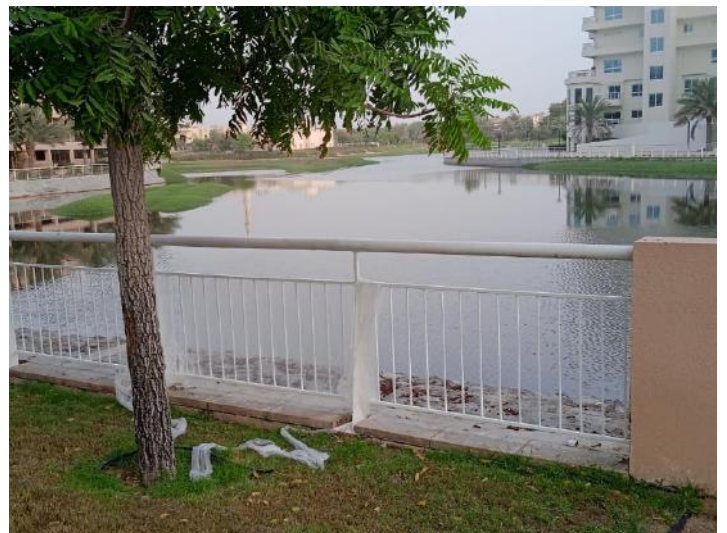
400 linear metres of fencing being replaced