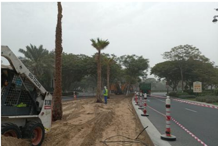
Soil preparations works are in progress at Gate 1. Planting will commence in October when the temperatures drop slightly.