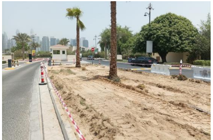
The works will be done in 16 sections, starting from all three gates and continuing inwards