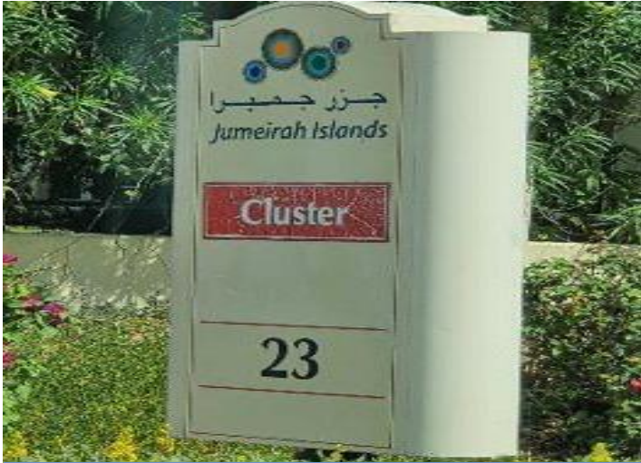
Existing wayfinding signage will be refreshed throughout the community