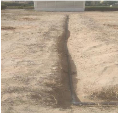
Irrigation and soil preparations are completed for the Fruit Farm, coming up in October 2022.