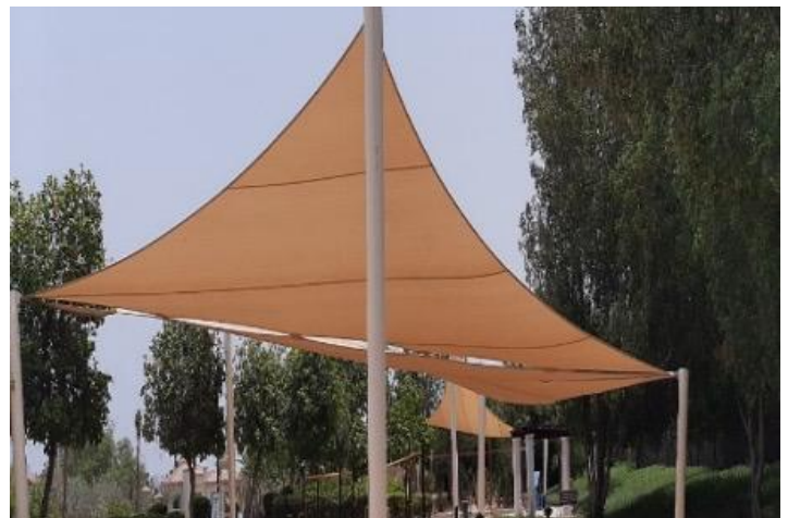
Newly-installed park sail shades across all 3 JI parks