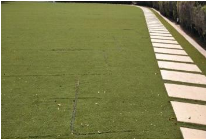
Existing Astroturf replacement— Cluster 22 Park