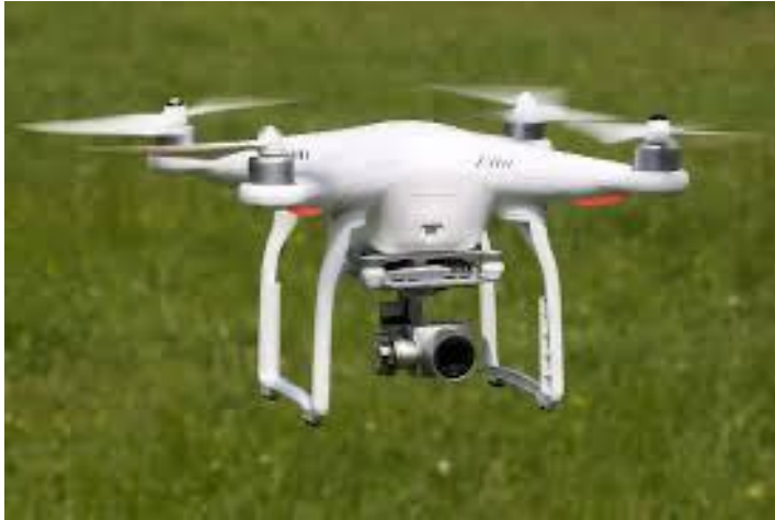
A drone survey of Jumeirah Islands will take place in September