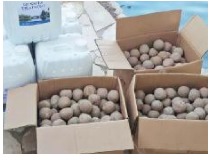
Mud Balls used in the Lakes Treatment program