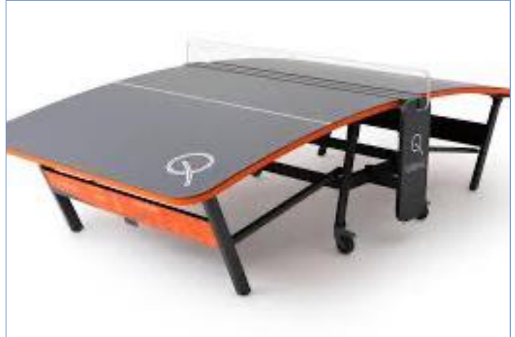
Teqball table and flooring installation works will take place in the park by Clusters 43 & 45