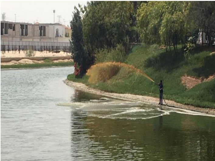
Effective Microorganisms (EM) treatment in progress in JI