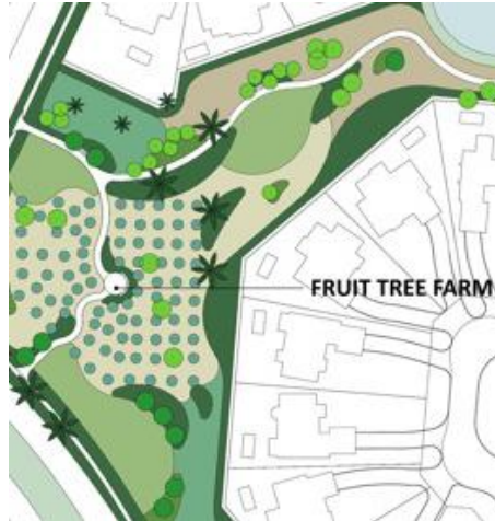
The footpath installations will commence in September.