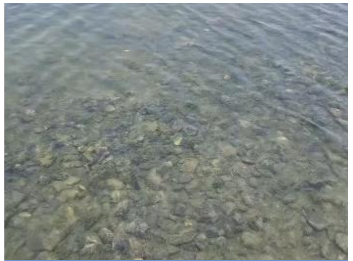
Current clarity of one of the lakes since the biological-based, Japanese EM technology treatment has commenced