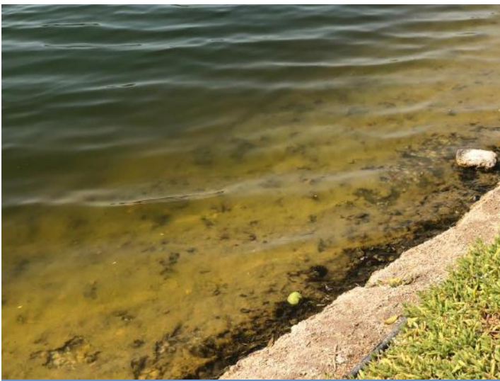
Reference picture of one of the 19 JI lakes prior to Lakes Treatment program commencement