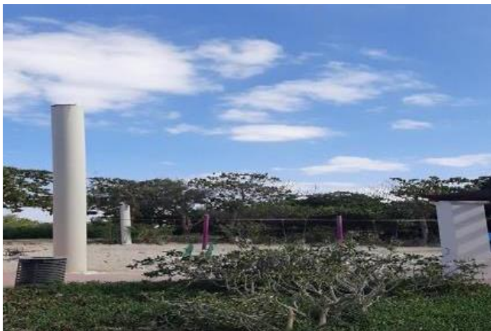
Sail shades posts & canopies in all 3 parks were refreshed